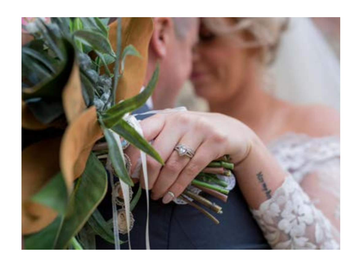
*Subject to weather

Following the ceremony there is time for photos, we suggest you consider our Post Ceremony Package. This package includes a glass of Tasmanian Sparkling and our chef's selection of canapés (3 per person), available at $16 per person.